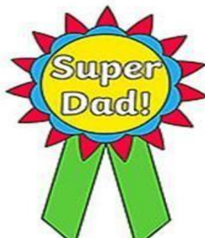
Father's Day Medals

Help your child to make a Badge for his father, as shown below. Ask them to pin it up for their dad and take a picture of them together.